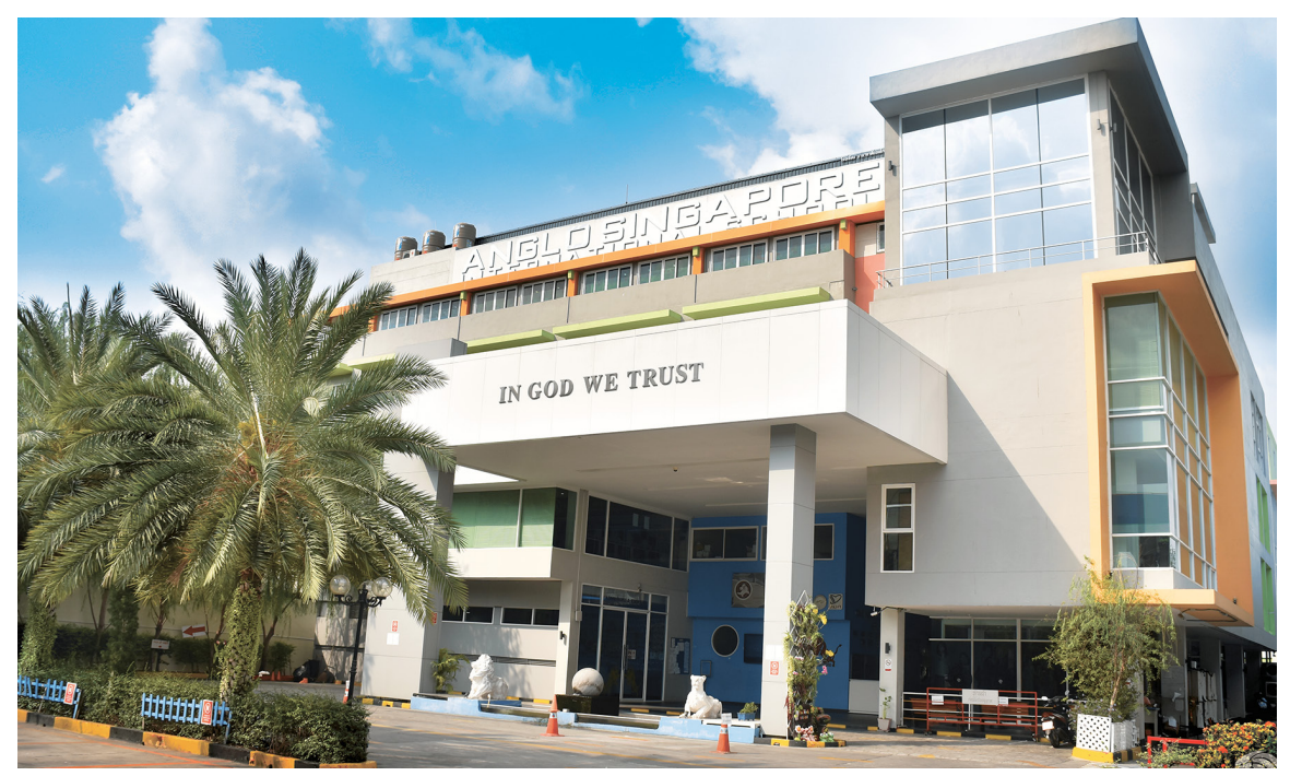
Anglo Singapore International School

Introducing a single, integrated school MIS the challenges and the benefits